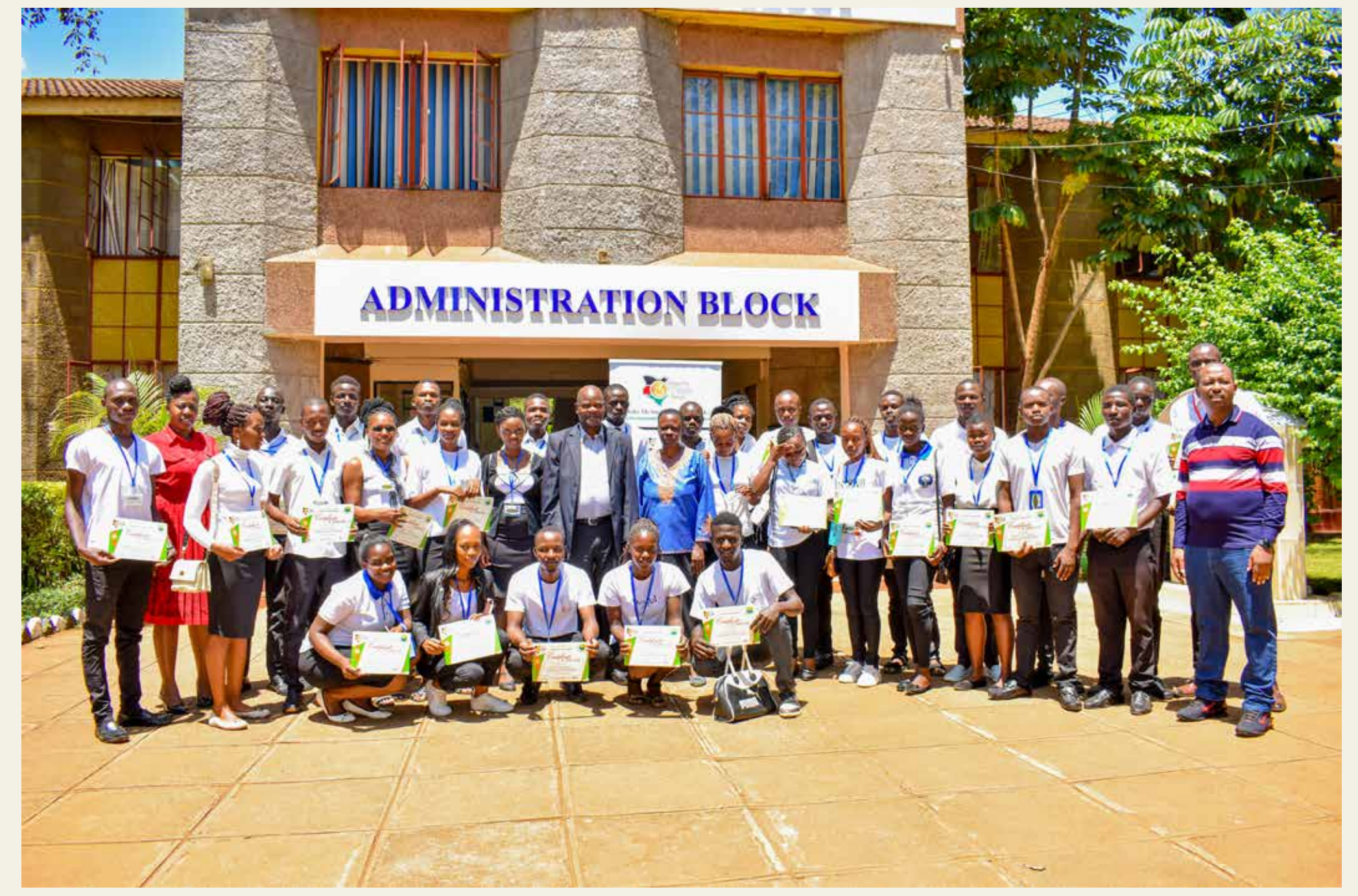
The peer educators all smiles during the group photo at the University Administration Block

outside the University and sensitizing their fellow students on HIV/ AIDS, Gender based violence, drug and substance abuse, cervical cancer among Though they others. say that practice is the hardest part of learning, training is the essence of transformation. Ours is to wish them nothing but the very best as they transform prepare to lives, a time. one at