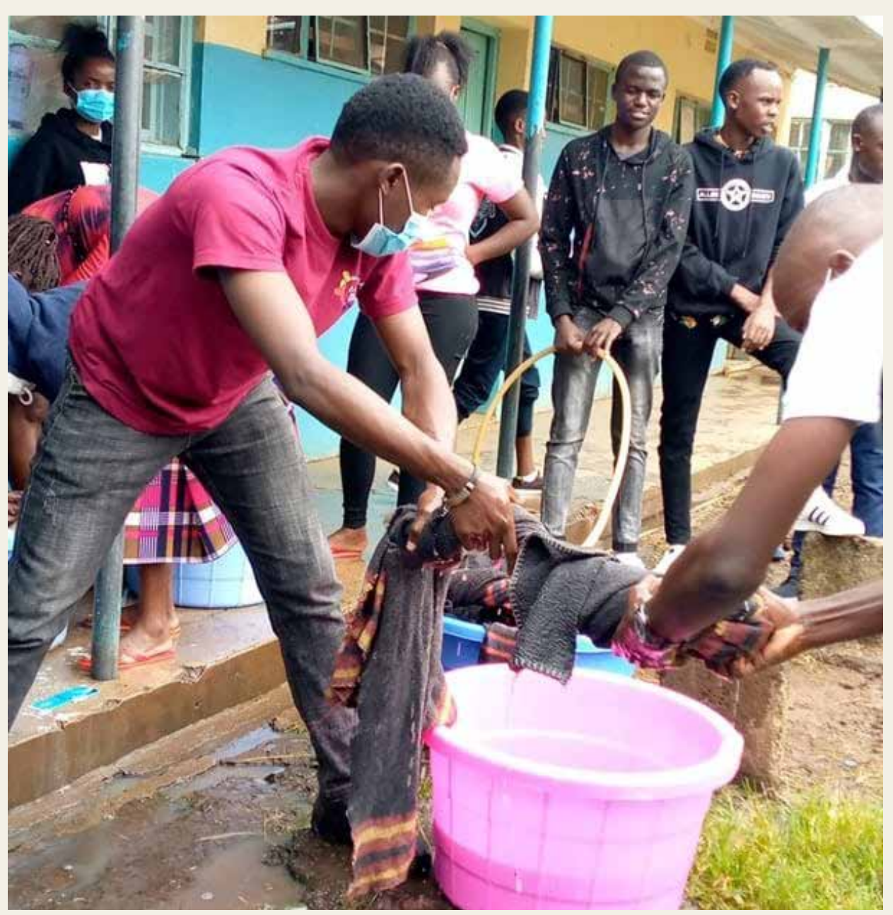
JOOUST Charity Club members wash clothes at an orphanage in Migori.

Over the years, the club has earned the enviable reputation of being one of the fastest-growing clubs in the university community boasting of a membership of over 100 people.