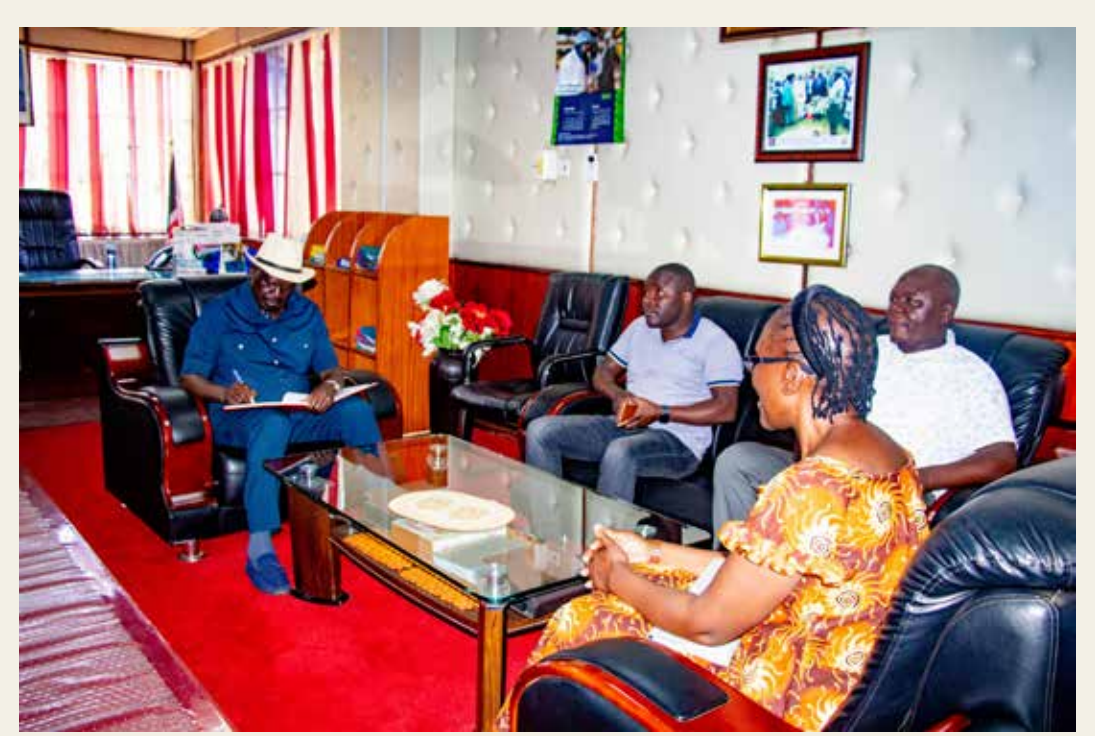
The Rt. Hon. Raila Odinga during a courtesy call at the Vice Chancellor's Office.