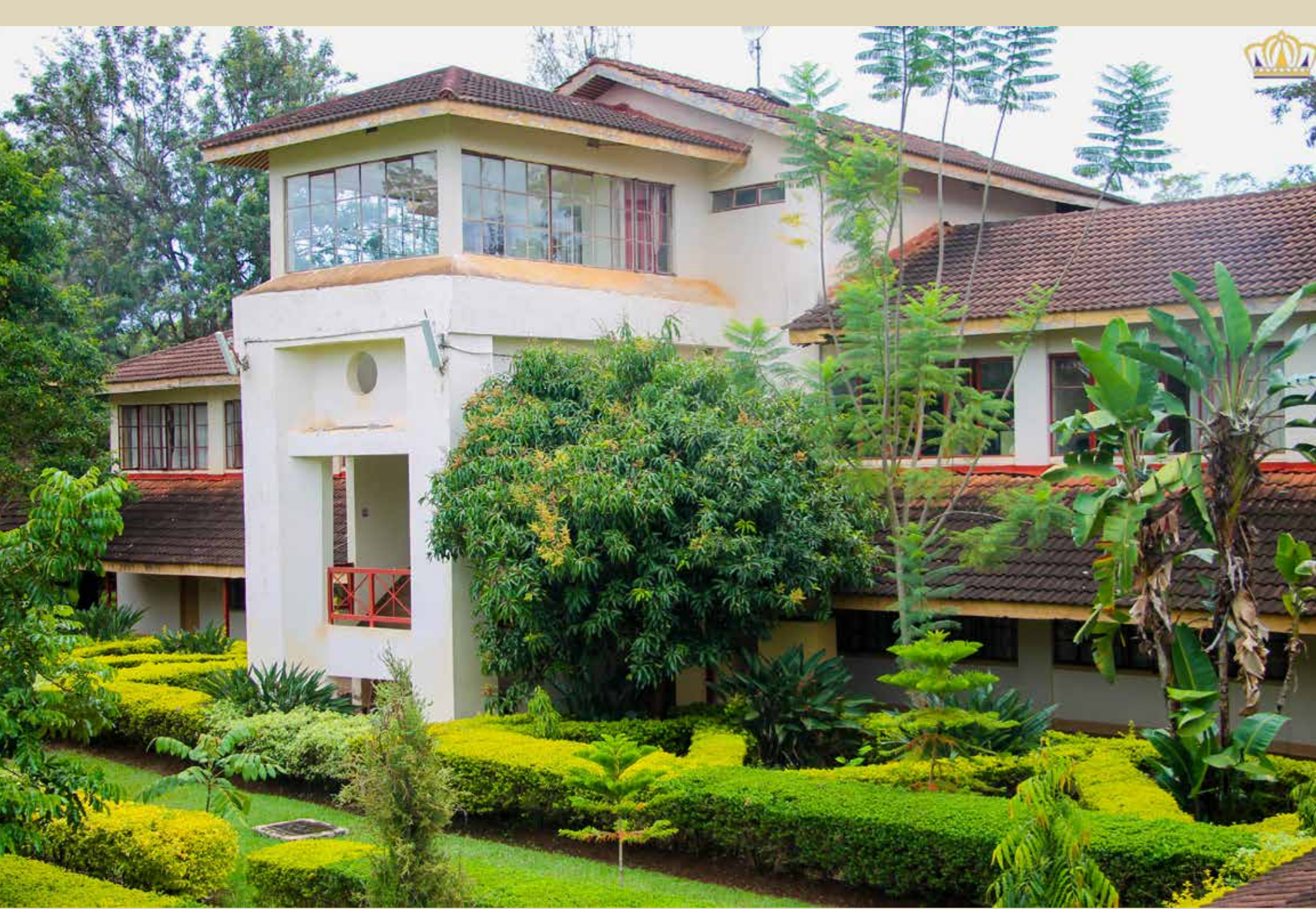
The University Administration block at a glance