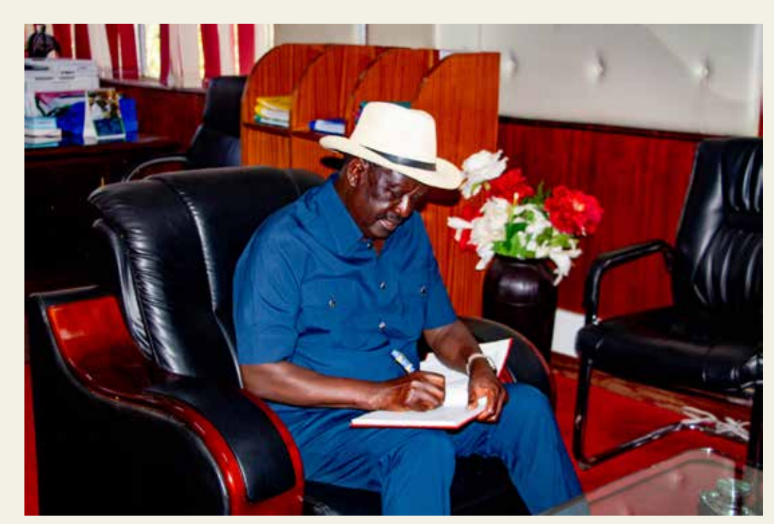
The Rt. Hon. Raila Odinga signs the visitor's book at the Vice Chancellor's Office.