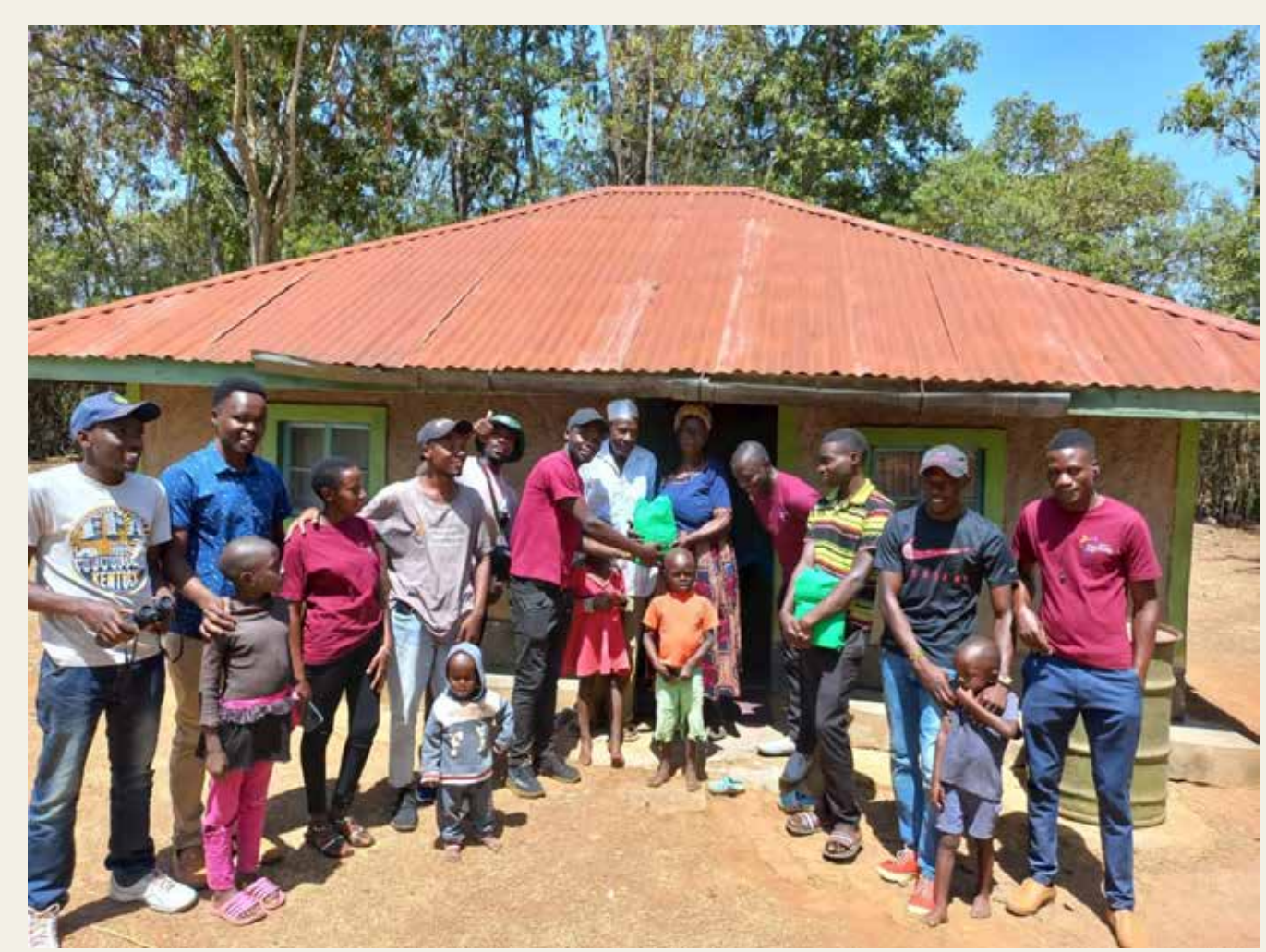
The Charity Club members visit the elderly near the Main Campus, in Bondo.