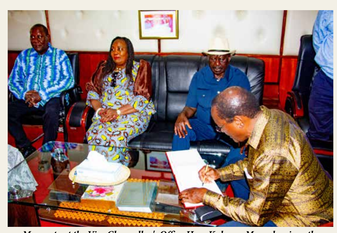
Moments at the Vice Chancellor's Office Hon. Kalonzo Musyoka signs the visitor's book.