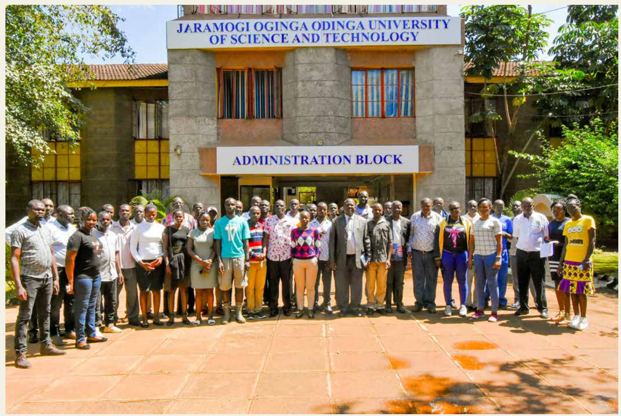
The\ participants\ pose\ for\ a\ group\ photo\ at\ the\ University\ Administration\ Block.

only within the academic circles of JOOUST but throughout the Nyanza region and beyond.