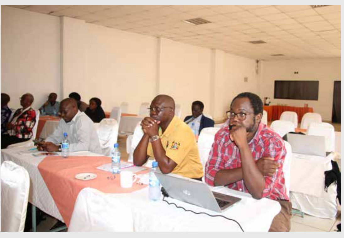
Participants listening to presentations made by PhD Students before the plenary session.