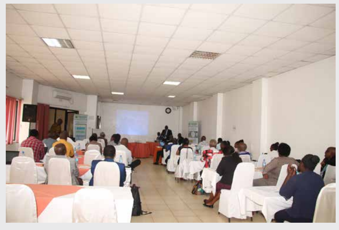
Participants listening to the presentations during the JOOUST VLIR Sub-project II launch.