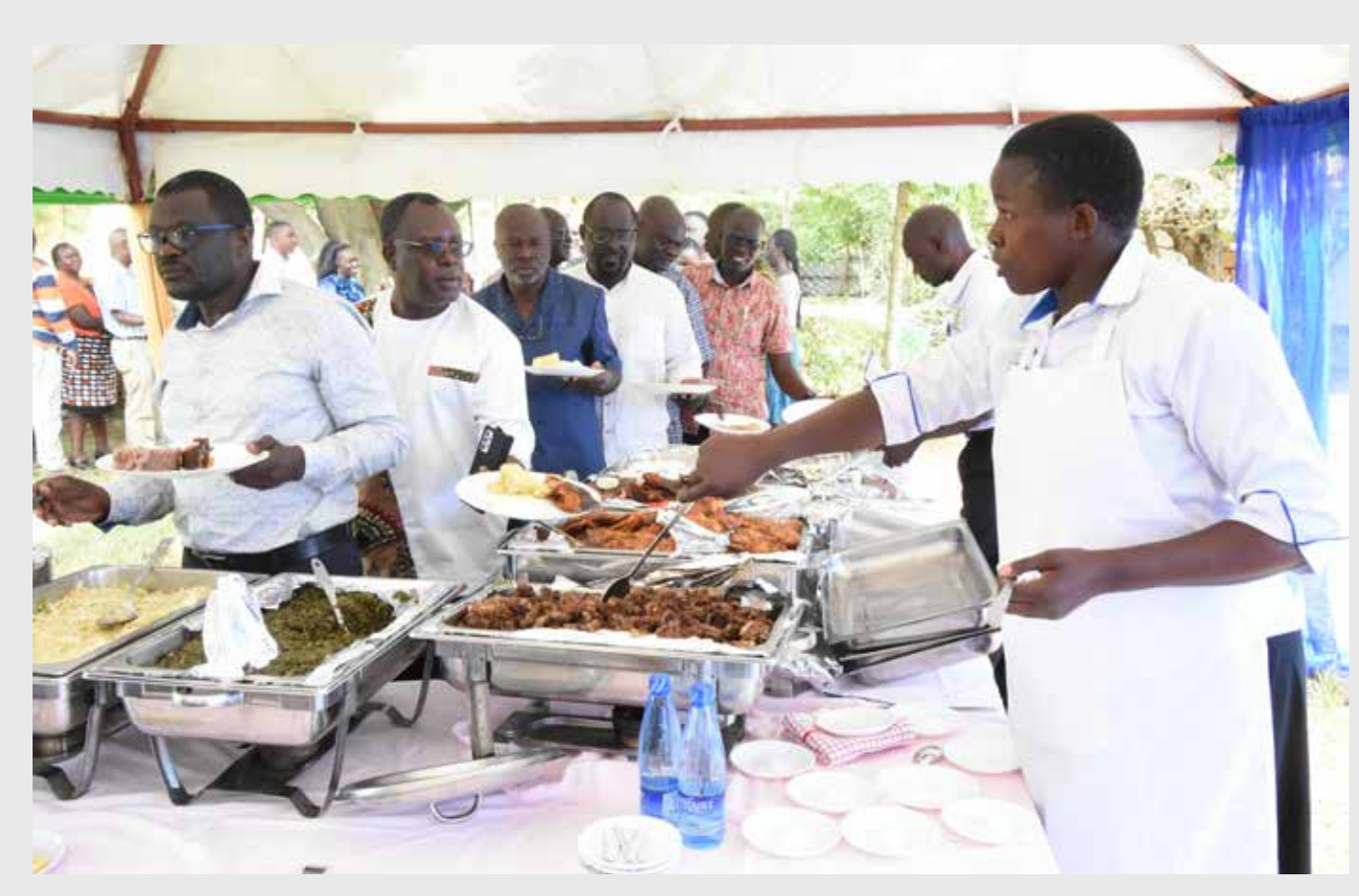
Members of staff queueing for delactables served during the luncheon.