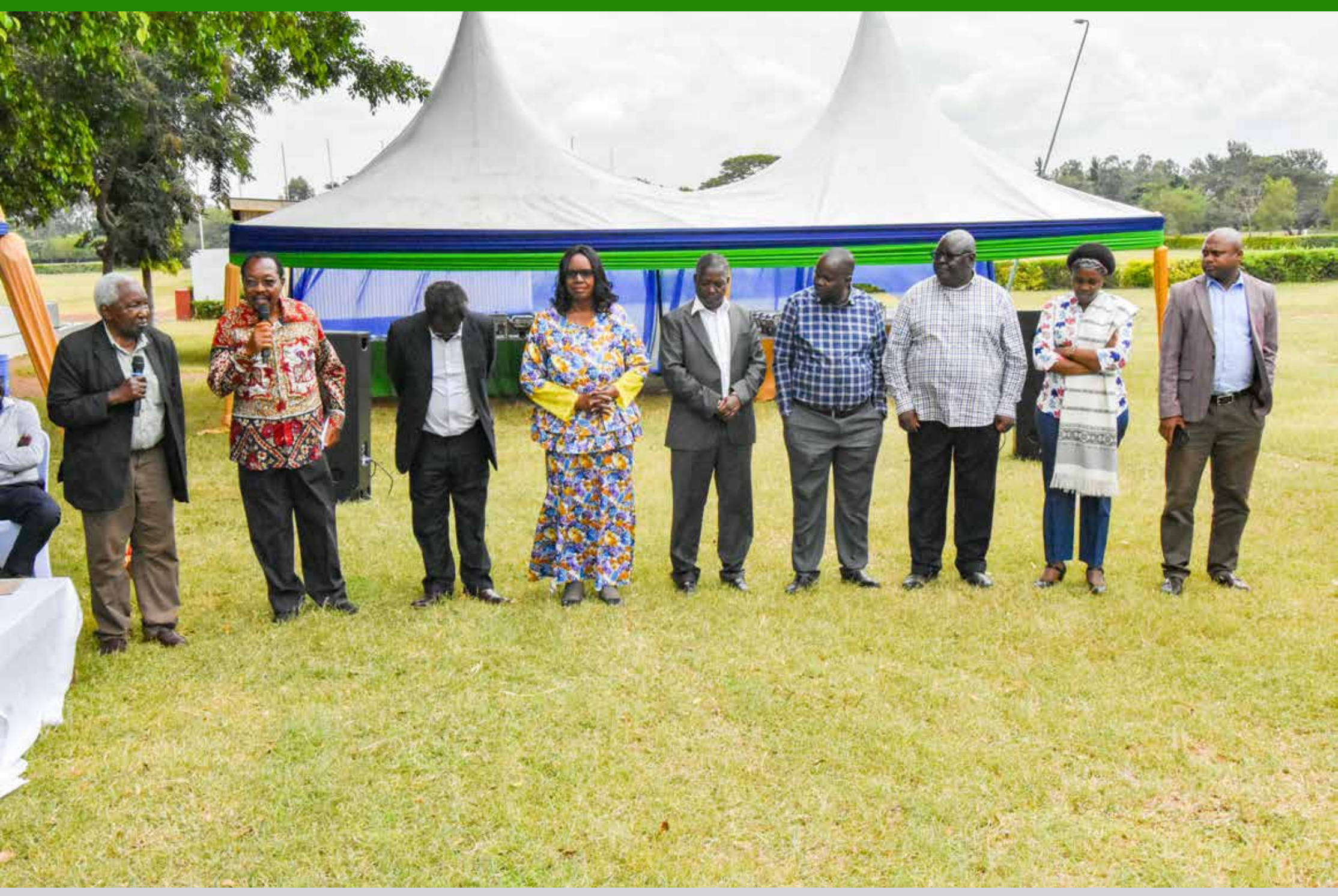
JOOUST University Council introduce themselves to members of staff.

A Publication from the Office of the Vice-Chancellor