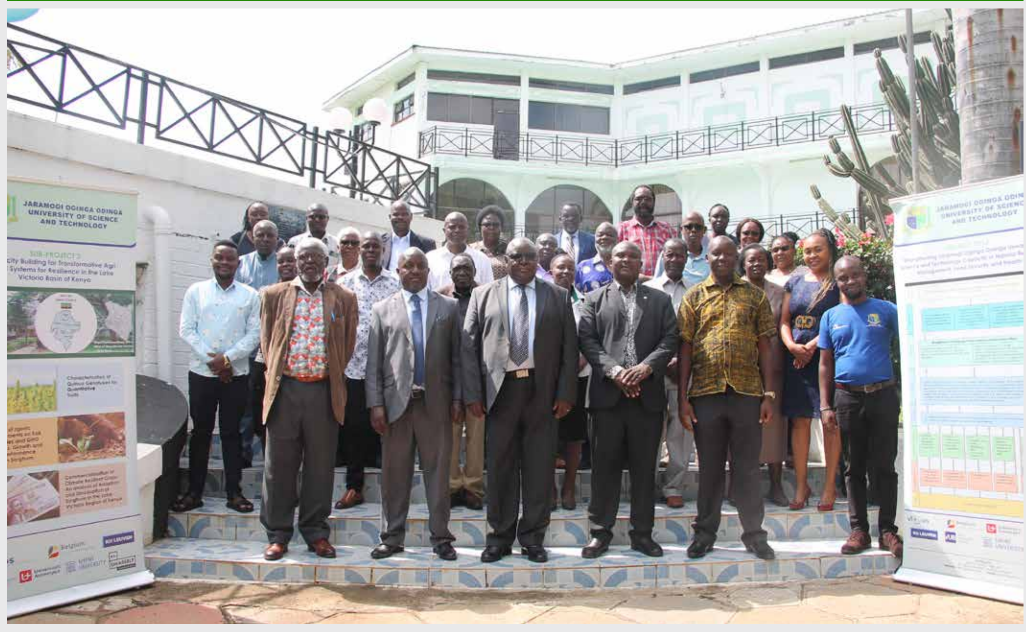
The JOOUST VLIR-IUC Sub-project II members and stakeholders pose for a group photo during the launch of the Sub-project held at Kisumu Hotel on 31st July, 2023.

University of Science and Technology VLIR-IUC Project officially launched Sub-Project II titled Building Capacity for Transformative Agri-Food Systems for Resilience in the Lake Victoria Basin of Kenya on 31st July, 2023 at Kisumu Hotel.