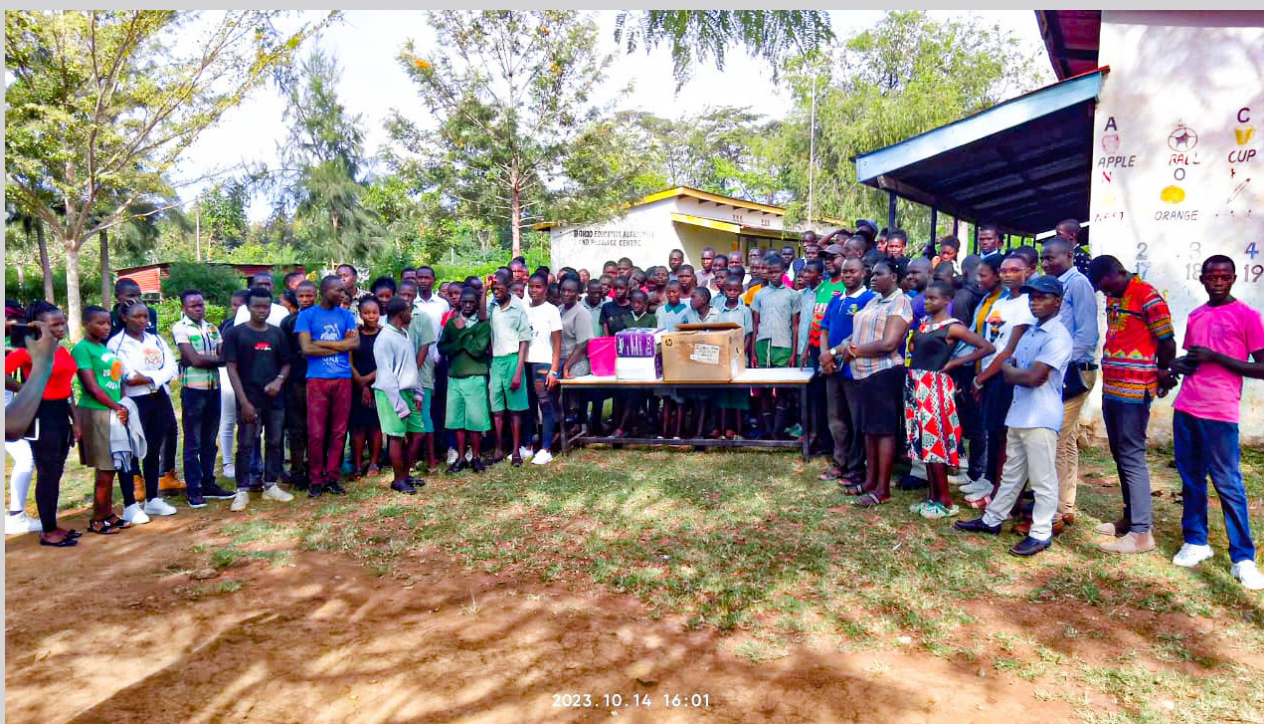
JOOUST Disability Advocacy Club pause for a photo with students of Nyamonye Small Home for Physically Handicapped.