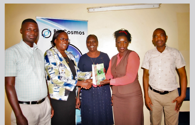
JOOUST Team receives book donations from the facilitators.

The students from these learning institutions will be drawn from diverse backgrounds and brought together with a view to realizing a common goal of upholding and advancing the core theory of Intelligent Design which states that "many features of the universe and life are best explained by an intelligent cause."