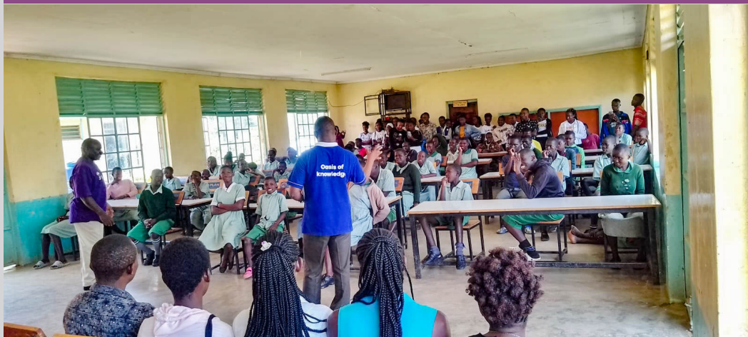
The Club members during an interactive session with students of Maranda special school for the mentally challenged.