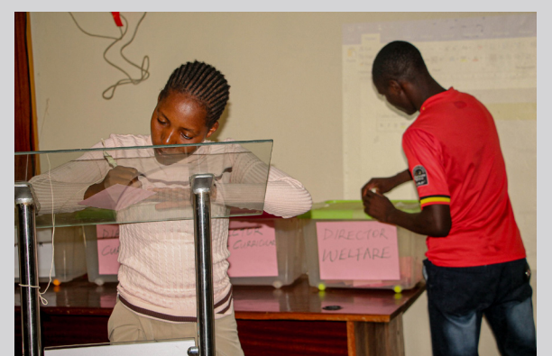
An ECR meticulously voting an aspirant.