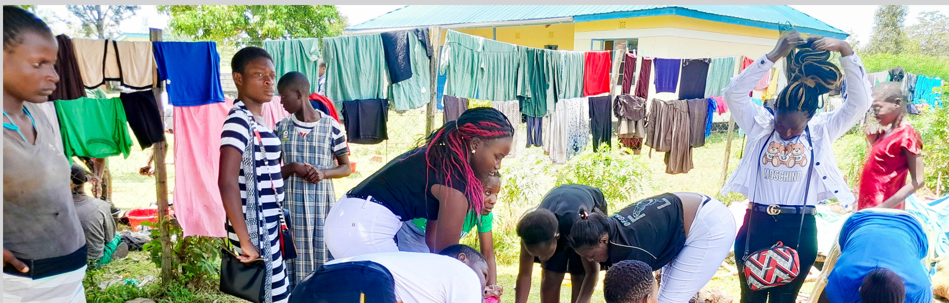
JOOUST Disability Advocacy Club members wash clothes at Maranda Special School for Mentally Challenged during the outreach.

The objectives of the club include to enable: the society at large to accept the individuals with disabilities and develop positive attitude towards PWDs, the differently abled children develop their talents through creation of sports and fun days, the