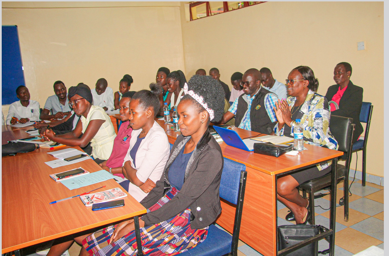
Participants keenly listening to the public lecture.

The participants gained a thorough understanding of Intelligent Design, its relationship with scientific inquiry, and the positive case for design in various domains at the end of the lecture before being provided with books on Intelligent Design by the teams from both