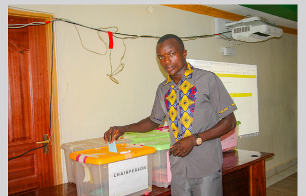
An ECR casting his vote in the ballot box.