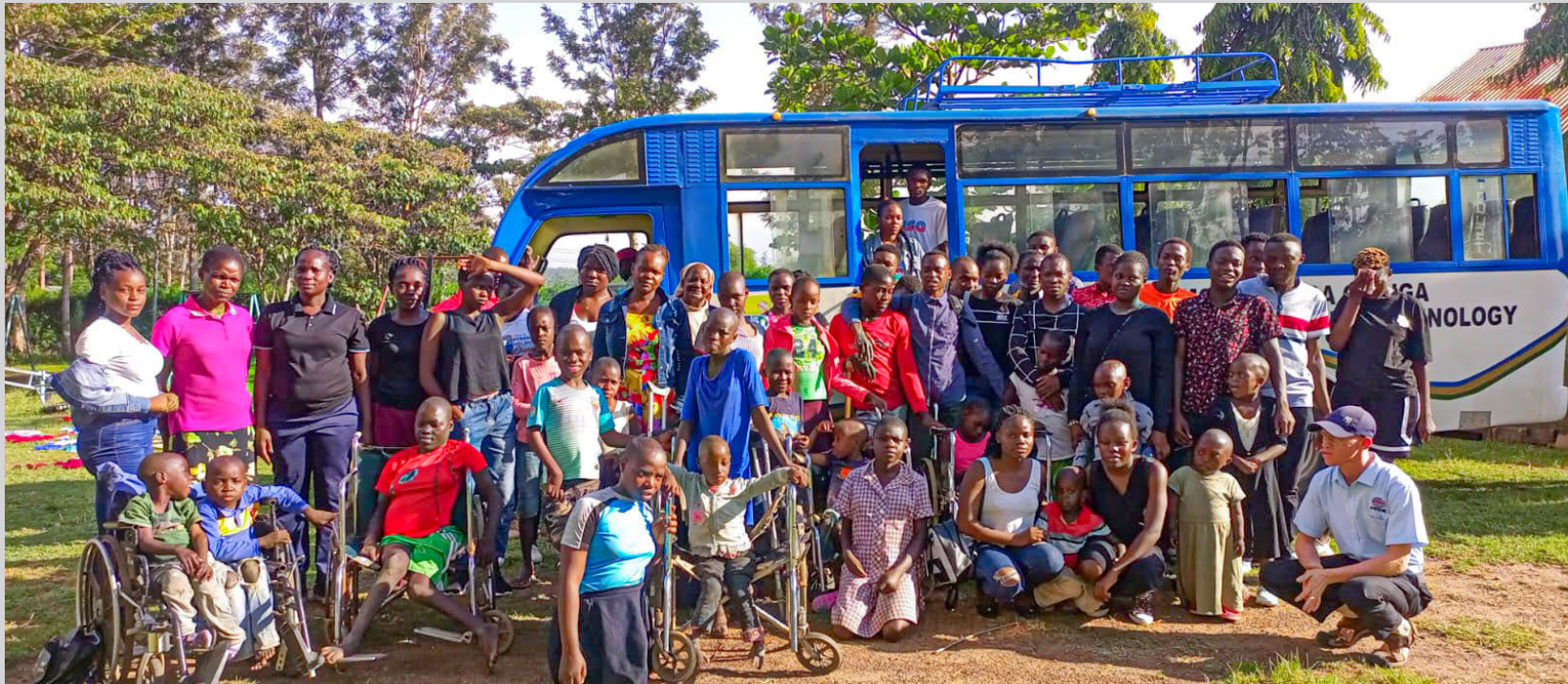
JOOUST Disability Advocacy Club pause for a photo with students of Nyamonye Small Home for Physically Handicapped.