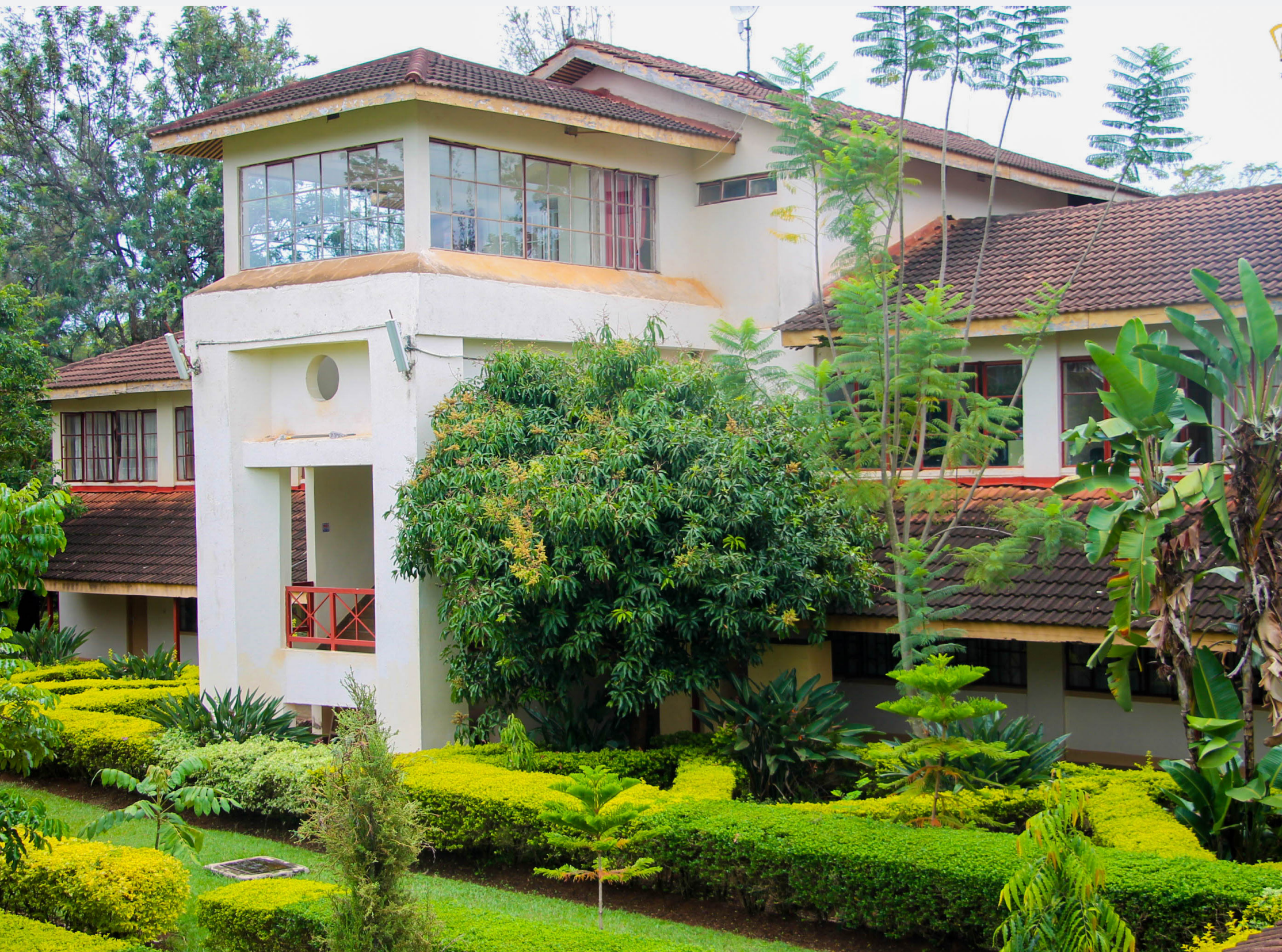
The University Administration block at a glance

A publication from the Office of the Vice-Chancellor