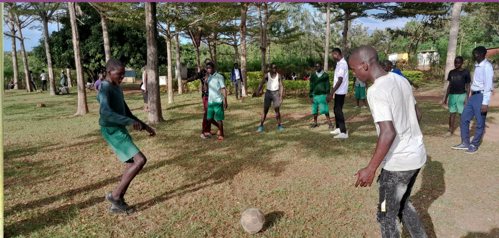
Club members share lights moment over a soccer match with Learners at Maranda Special School.

T he Jaramogi Oginga Odinga University of Science and Technology Disability Advocacy Club organized an outreach programme on the 14th of October, 2023 to Maranda Special School for the Intellectually Disabled and Nyamonye Small Home for the Physically Challenged which is hosted inside Nyamonye Primary School.